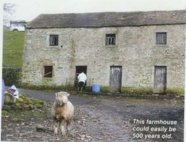
This farmhouse could easily be 500 years old.

Day 1 began at 09.30 the following morning. It offered opportunities for driving greenlanes through the picturesque Dales of Wensleydale and Swaledale, which provide a number of challenging stretches of trail, and excellent views across breath-taking valleys carved by the movement of long-since departed ice-age glaciers. The first track saw Paul's 80-series lead the caravan of off-road vehicles; mostly Land Cruisers, a