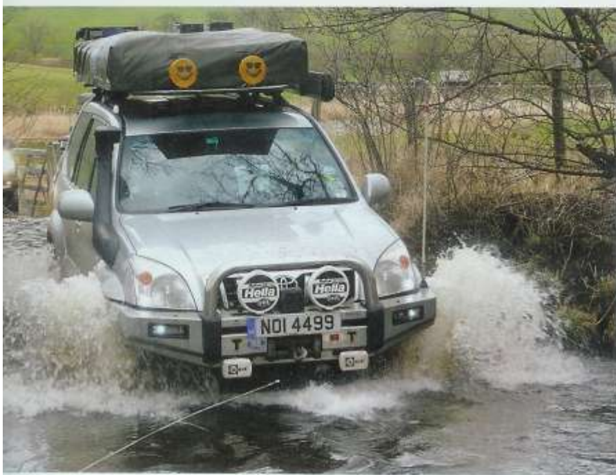
Left: There are water crossings a-plenty in northern England. With a snorkel, TJM bumper and Superwinch inside, this Prado had no worries doing the Helwith Ford crossing.

Road, a typical example of Roman transport infrastructure. As night fell, the group made their way to a local pub for a well-earned pint, and gathered around the wood-fed hearth to share stories from their first day in the Dales. It had been cold, wet and windy for the majority of the day, but hearts were warm and spirits were high as we reflected together upon a good day's driving.