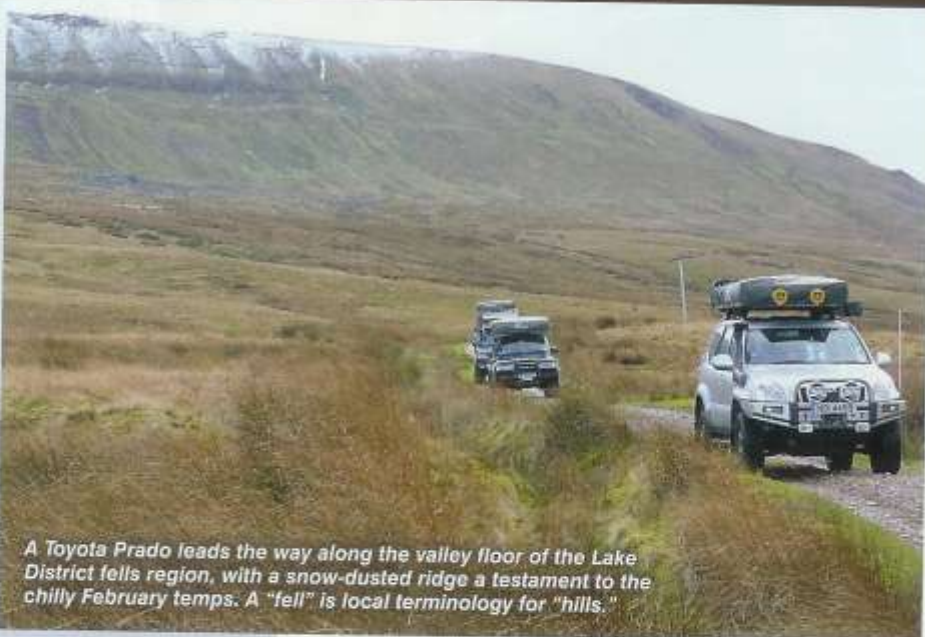
A Toyota Prado leads the way along the valley floor of the Lake District fells region, with a snow-dusted ridge a testament to the chilly February temps. A "fell" is local terminology for "hills."