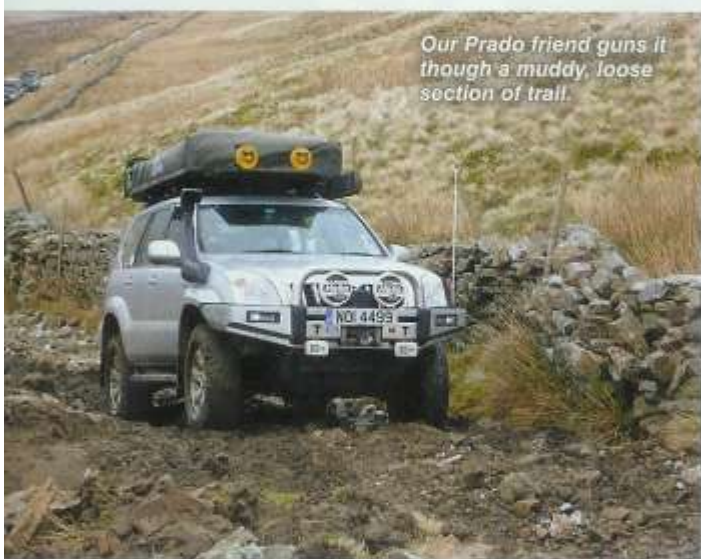
Our Prado friend guns it though a muddy, loose section of trail.

Below: Another well-outfitted 80-series joined the Yorkshire Dales trip, this one nicely done up with South African Hannibal tent and awning, snorkel, TJM bumper and big ol' storage box with Hi-Lift jack.